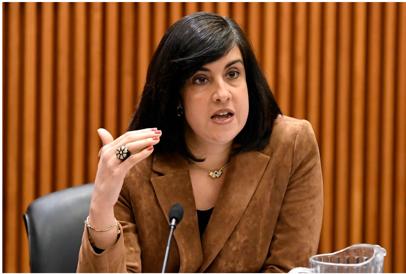
Assemblywoman Nicole Malliotakis in 2019.